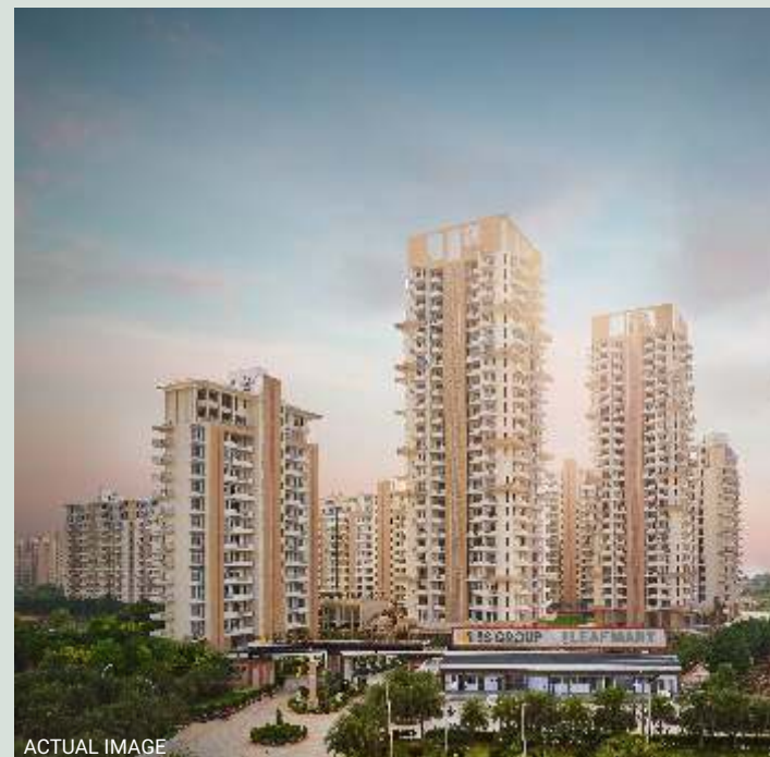
THE LEAF, SECTOR-85, NEW GURUGRAM