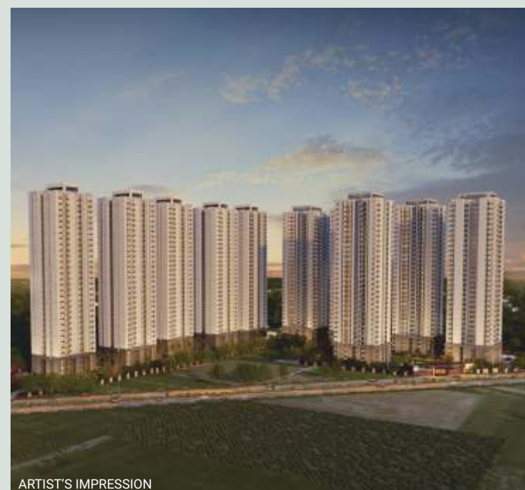
SS CENDANA, SECTOR - 83, NEW GURUGRAM