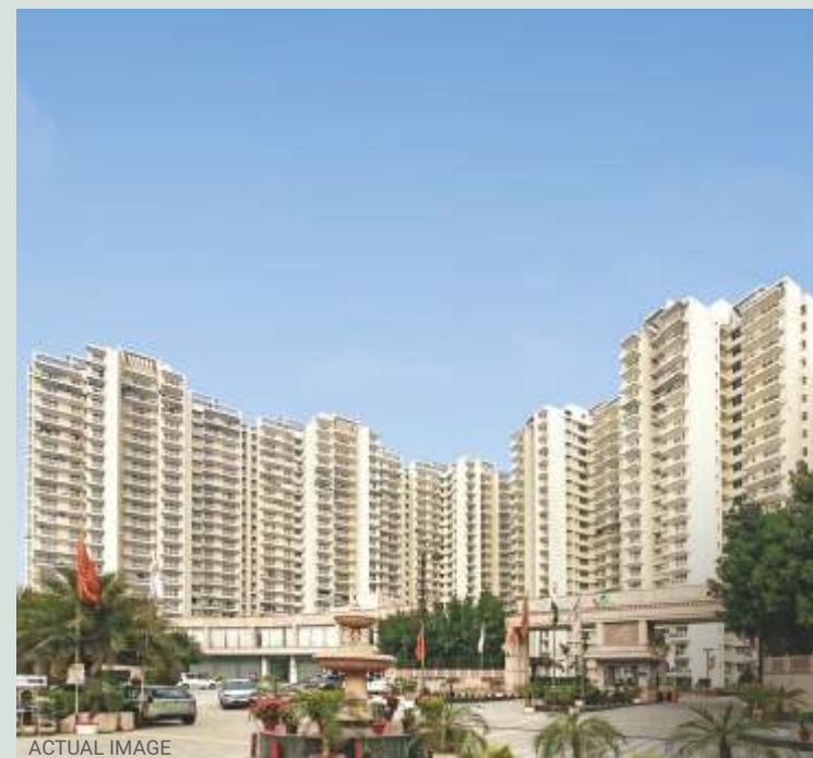
THE CORALWOOD, SECTOR-84, NEW GURUGRAM