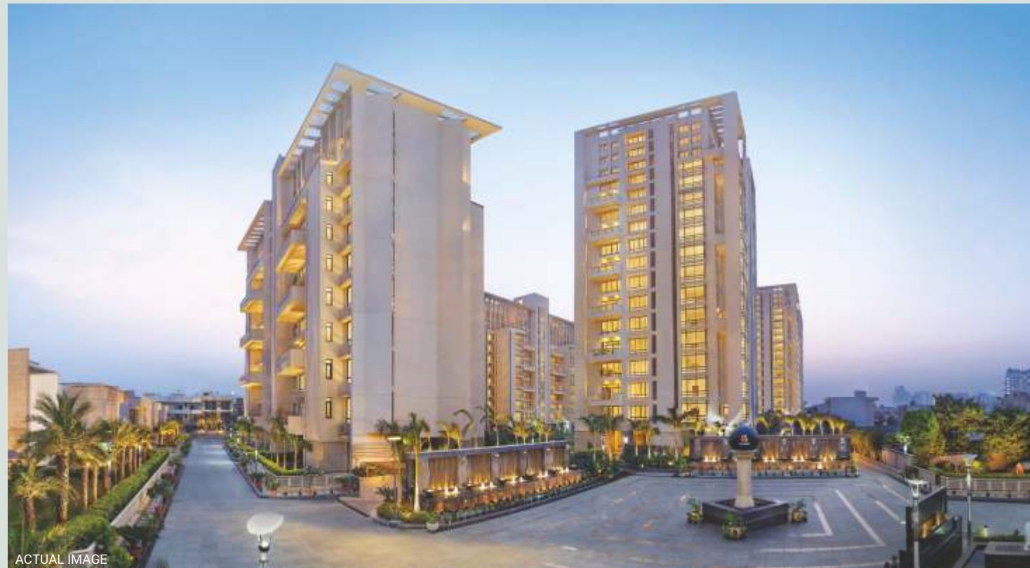
THE HIBISCUS, SECTOR-50, GURUGRAM