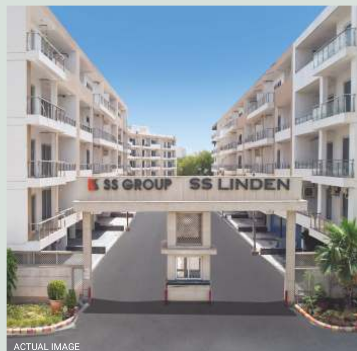
SS LINDEN, SECTOR 84 - 85, NEW GURUGRAM